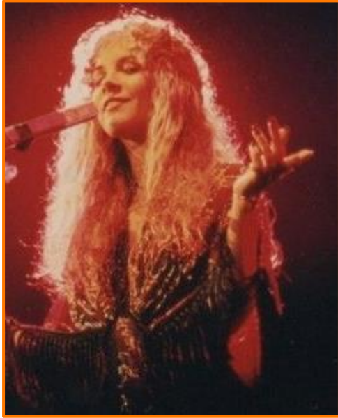
Stevie Nicks Singer, Songwriter